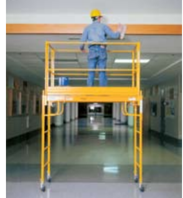
0127-006-1 shown in a maintenance application.

Sign Installation and Maintenance Overhead Door Installation Lighting and Wiring Maintenance General Building Maintenance Window Treatment Installation