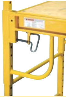
Unique Saf-T-Lok® provides added safety and is more efficient for use.