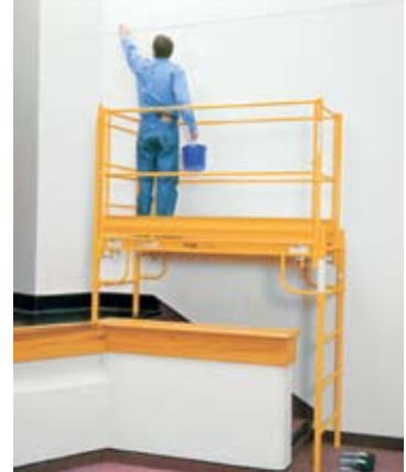
Pro-Jax units (with casters removed) can be used on stairs.