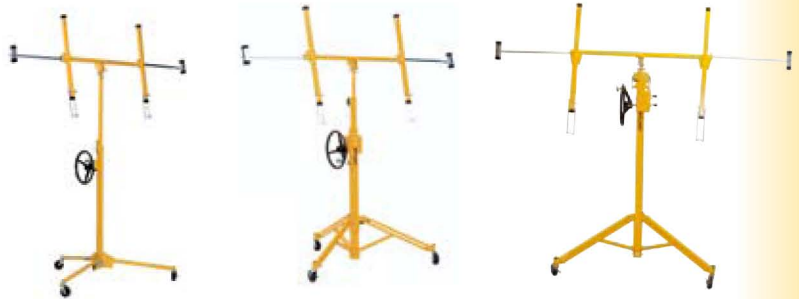
Panel-Jax Drywall Lift Model DL 100, 5'-10'

The Drywall Lift holds 4' x 12' sheets of drywall, and knock down for easy storage and handling. The winch designs use a steering wheel for easy adjustment.