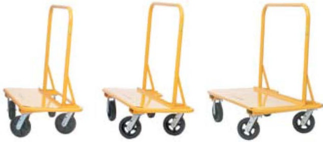
Drywall Cart DC 3000 LD

The Drywall Cart is designed to haul full capacity loads with easy maneuverability and complete stability. Support bracing is removable for easy storage and handling.