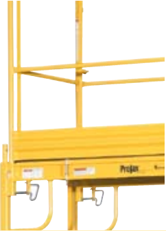
Unique design allows guard railing to stay at platform level at all times. Platform level adjusts in 2" increments.